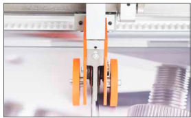
Single lengthwise rotary crush cutter (twin cutters optional)