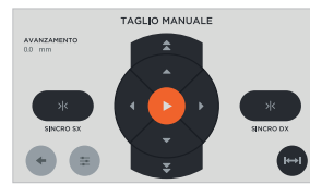
User-friendly software design