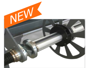
Heavy duty unwinding shaft for rolls Ø 400 mm up to 90 kg weight (optional)